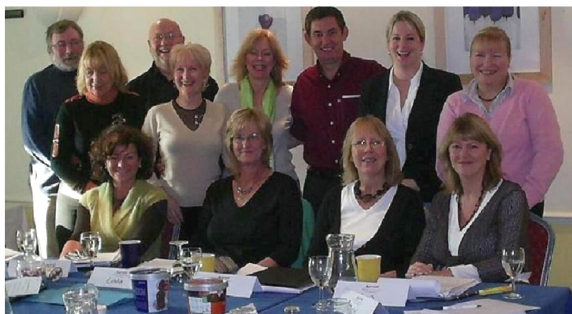
A happy training group

The cost of the course is £499.00 (Inclusive of 20% VAT)